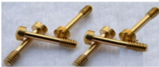
Captive Screws Brass Panel Screws

We are manufacturers suppliers of Brass Captive Screws Brass electronic hardware fasteners Panel Screws Thumb Screws